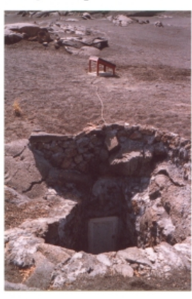
Entrance to the lava tunnel where the sensor is located.