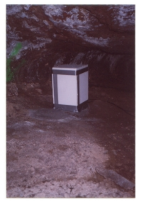
CMG-40T sensor with thermal insulation, inside the lava tunnel.