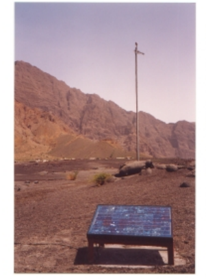
Outside view of station FPPC, in the caldera of Fogo Volcano.